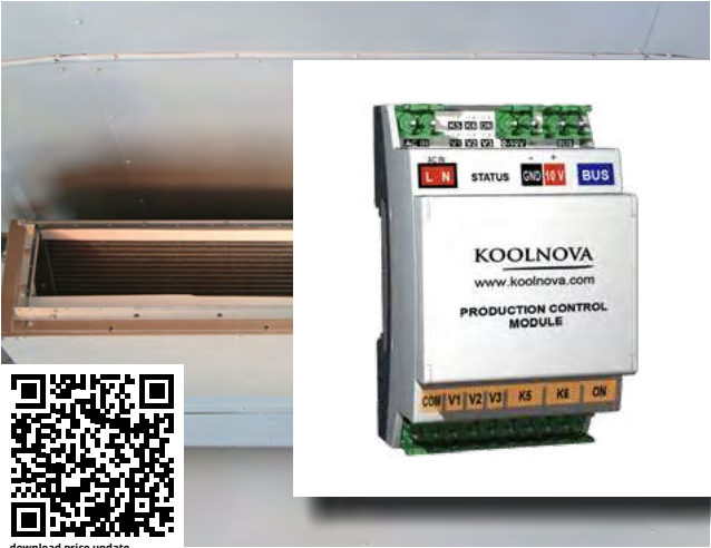
download price update